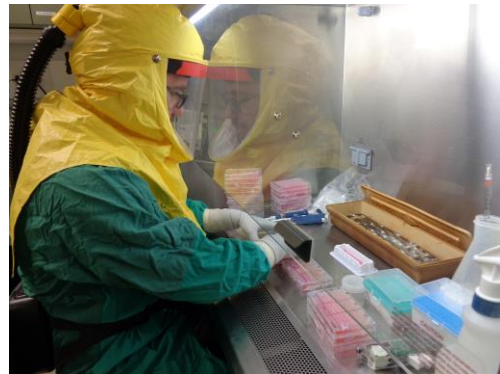
Training in operations at the THCF mirror the GMP requirements for biopharmaceuticals and biomanufacturing, providing broad opportunities for CL3 trainees.

An analysis by BioTalent Canada predicts that by 2029, Ontario's biomanufacturing sector will face a labour shortage of 5,820 workers. Only 25% of those positions are projected to be filled if steps are not taken to train more skilled workers.